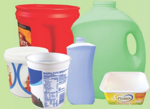
Rigid Molded Plastic Containers - No lids