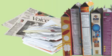
Mixed Paper/ Paperboard