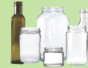
Non Refundable Glass