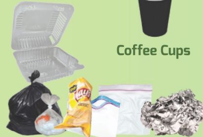
Single Use Packaging