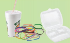
Styrofoam & Rubber