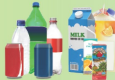
Deposit Items Including: Mix Containers Pop & Beer Cans and Bottles Tetra Paks