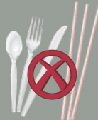
No Straws/ Plastic Utensils